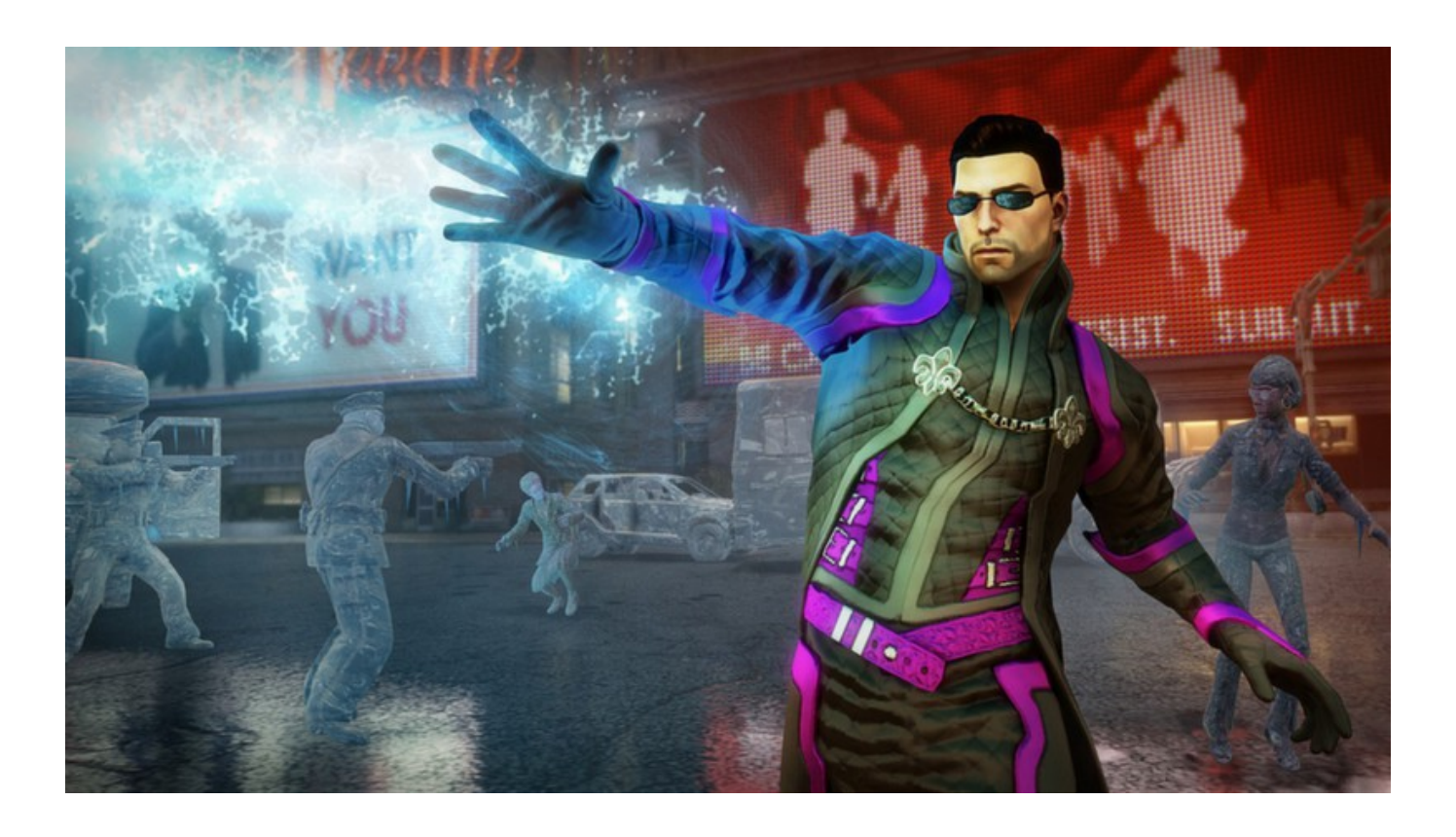
Borderlands 2 Crack Download Offline Activation

Download ->>> <a href="http://bit.lv/2NJ7EAU">http://bit.lv/2NJ7EAU</a>